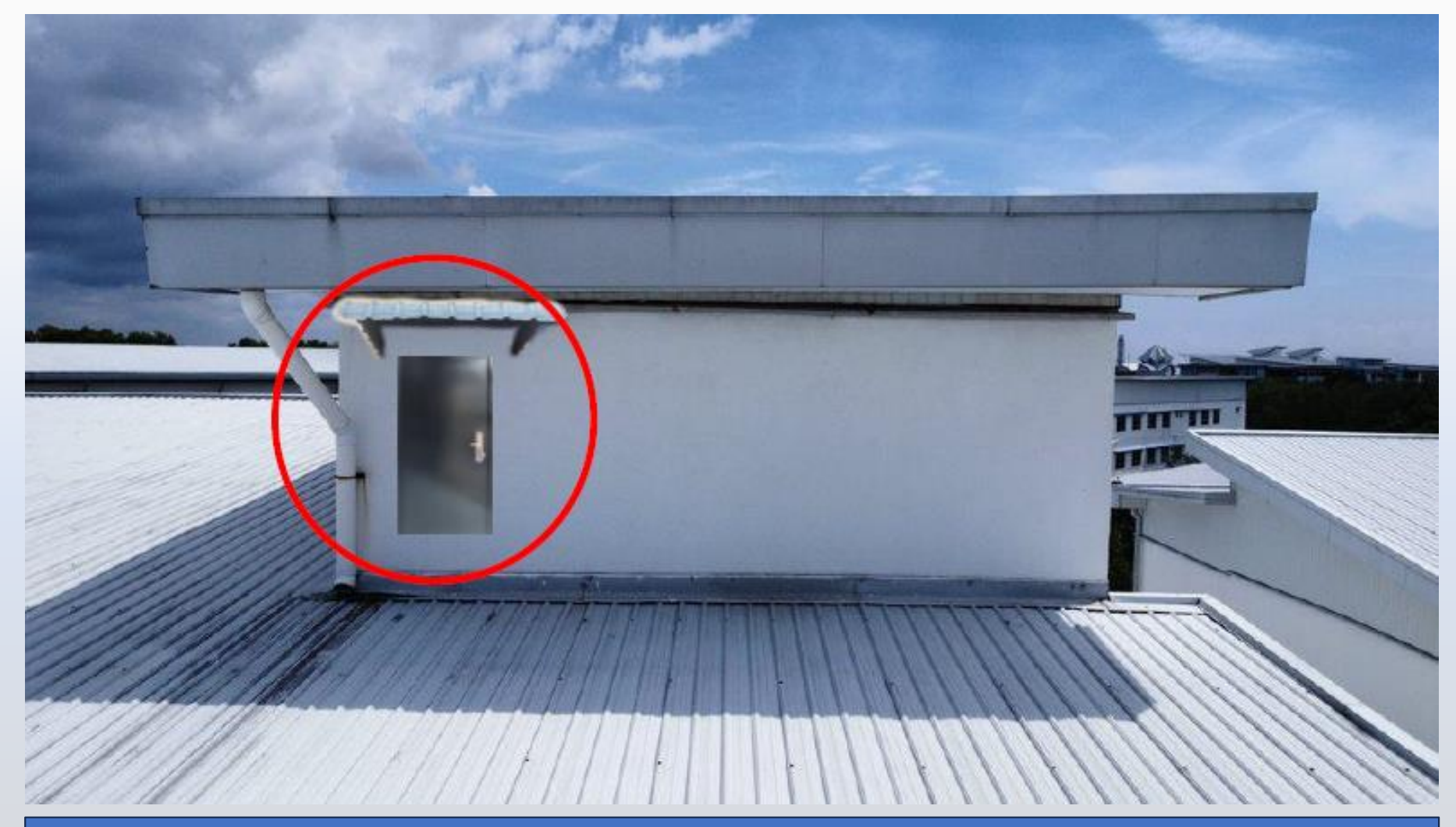
Access Door (FKM Blok Pentadbiran)