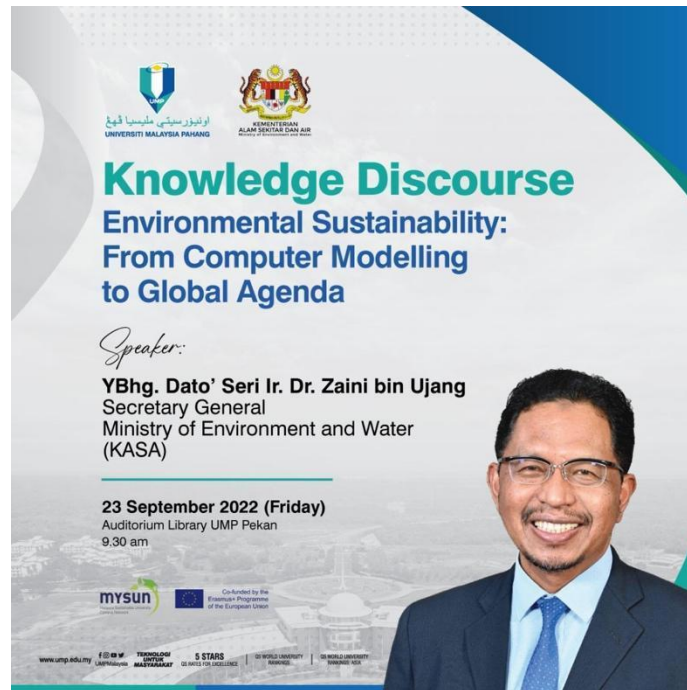
Figure 4. Roundtable Discussion with Ministry of Environment & Water