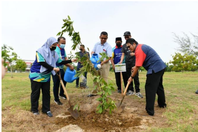
Figure 5. Campaign on Tree Planting