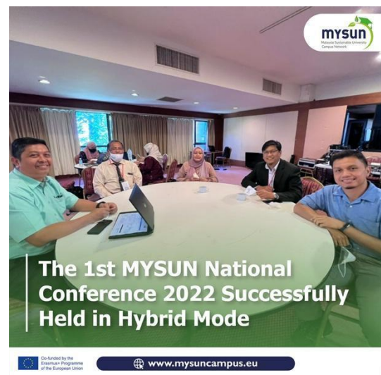
Figure 8. MYSUN 1 st National Conference