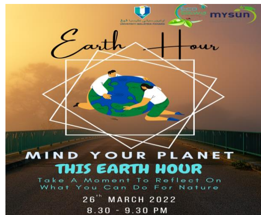
Figure 6. Earth Hour Campaign