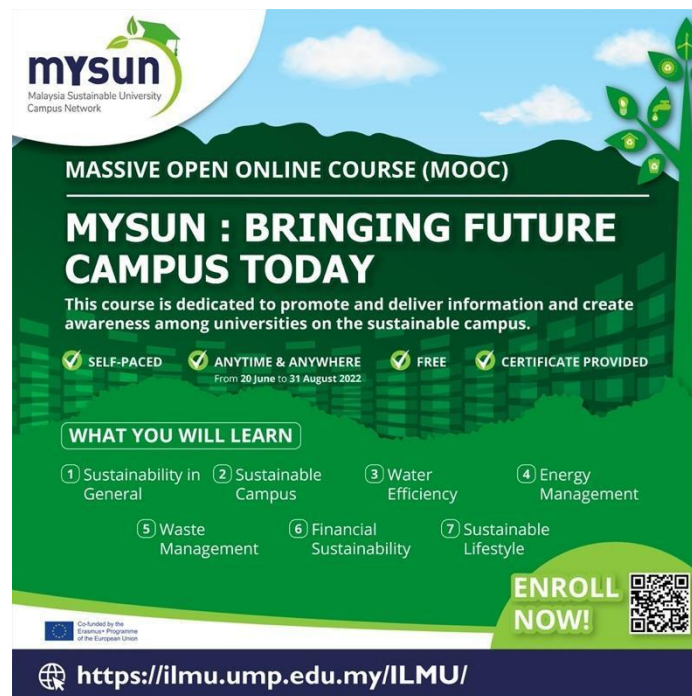
Figure 2. Promotion of MYSUN MOOC Courses