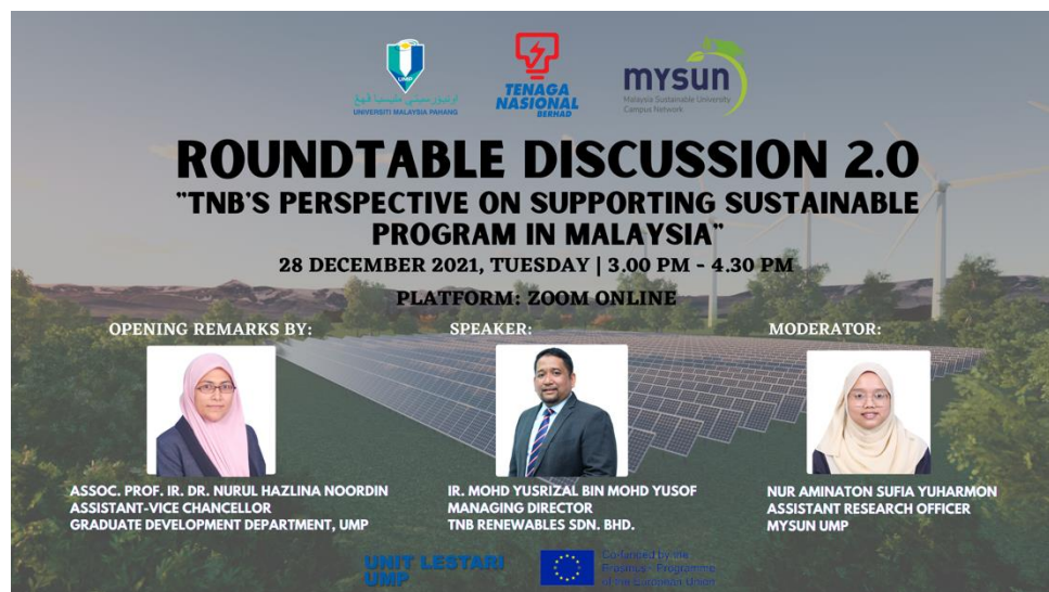
Figure 3. Roundtable Discussion with Tenaga Nasional Berhad