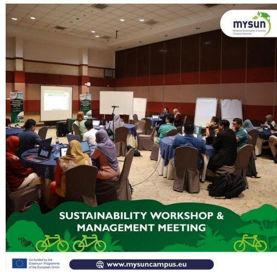
Figure 7. MYSUN Sustainability Workshop & Management Meeting